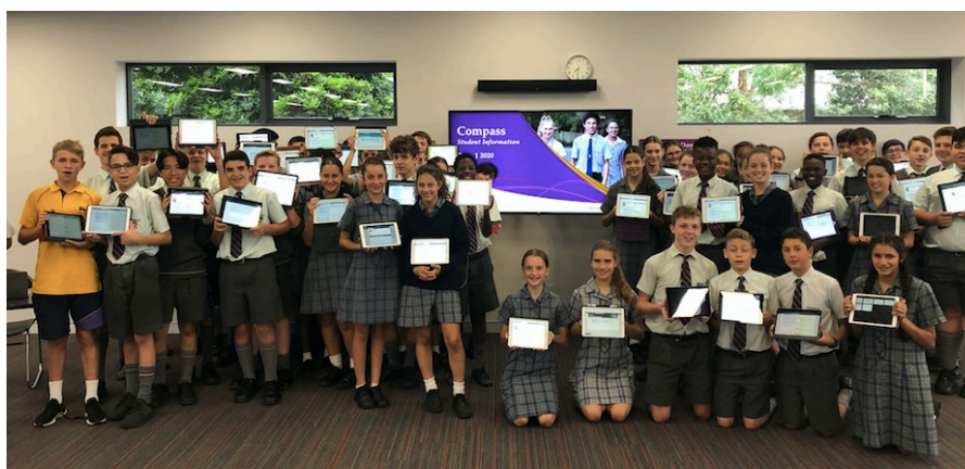
Year 8 at their Compass presentation - Mary MacKillop Centre

See link for the presentation: Compass & Pastoral Update - Tuesday 25th February