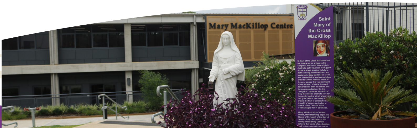
Saint Mary of the Cross MacKillop