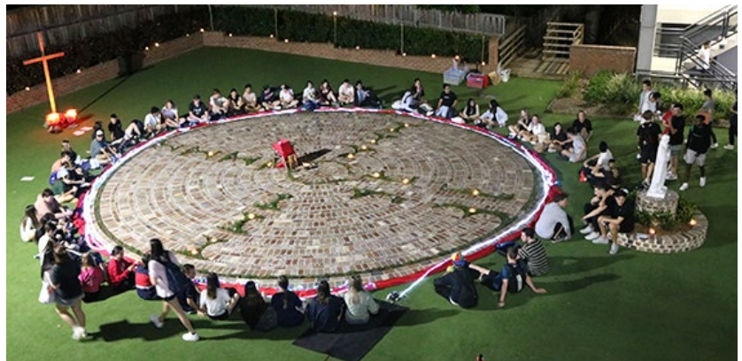
The Labyrinth on Loyola Green was the centre of Year 12 Spirituality Day closing ceremony.