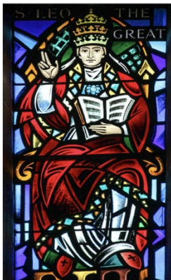
St. Leo the Great, Pope and Doctor Late Fourth Century - 461

Today, Tuesday 10 November, is the Feast Day of Pope St Leo the Great, the Patron Saint of our College. Each year we celebrate this day later in Term IV (mainly due to the HSC).