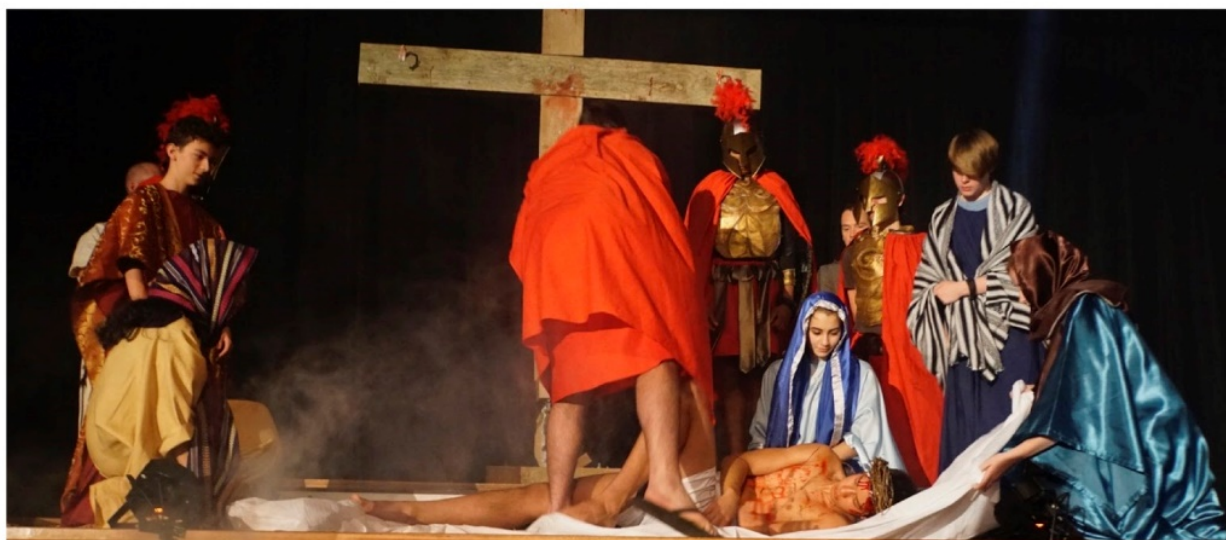
Stations of the Cross – Via Dolorosa

The stations will take place in The Light of Christ Centre at 11.10 on Holy Thursday, Week 10.