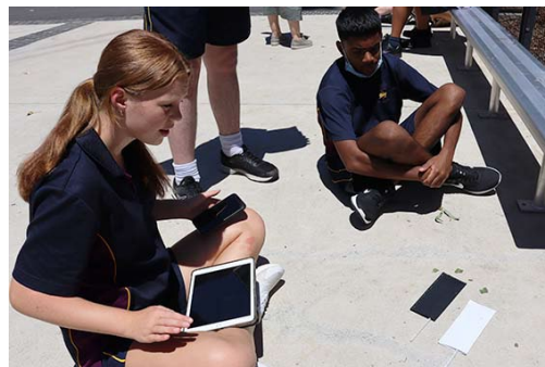
1 Science students measure temperature differences between black and white today.

Here at St Leo's, we encourage our young people to adopt and immerse themselves in a growth mindset way of thinking across all areas of their formative years.