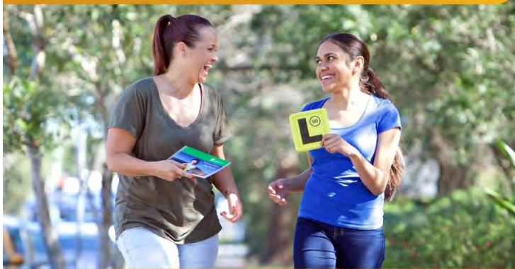
Helping learner drivers become safer drivers

The 90 minute session will offer practical advice about: