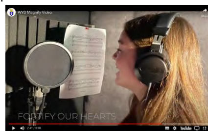
A screenshot from the music video!