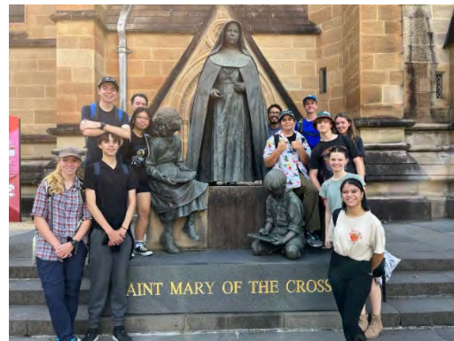
And a stop by St Mary's Cathedral for a time of prayer.