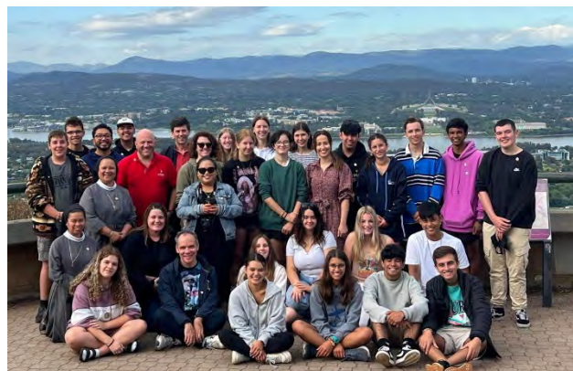
The Broken Bay group in Canberra following a final prayer session on Mount Ainslie lookout.

Year 11 and six Year 12 students attended the CSYMI Youth Ministry Equipping School in Canberra. This is aimed at student leaders from around Australia who wish to grow in leadership and gain skills in sharing their faith with others.