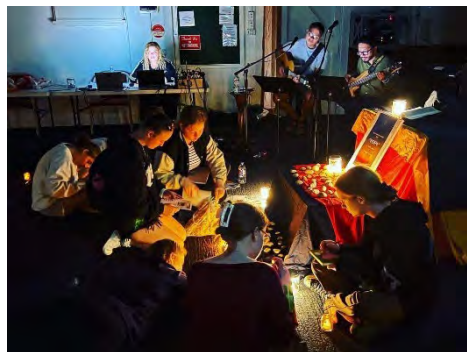
Students experiencing different forms of prayer and reflection on Venio.

Last weekend, one Year 10 and four Year 11 students participated in the CSYMI Venio Youth Ministry Retreat at the Josephite Centre for Spirituality in Kincumber, along