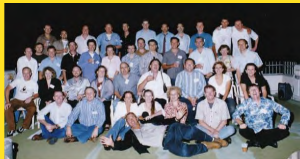
Photo from 20-year reunion.

St Leo's Class of 1984 40 Year Reunion! (First year with graduating girls) 19 October 2024, 5pm The Blue Gum Hotel, Waitara Please spread the word!