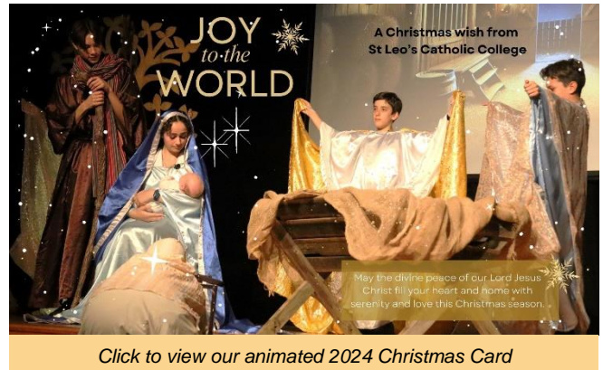
Click to view our animated 2024 Christmas Card

May your Christmas season be filled with love, joy, and compassion. Amen.